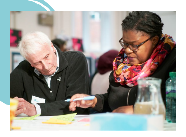
Waltham Forest Citizens' Assembly on Hate Crime.